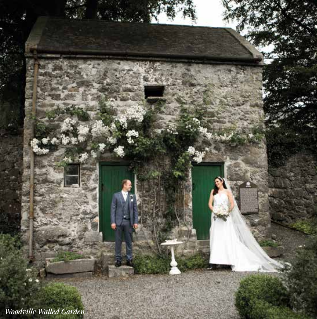
Woodville Walled Garden