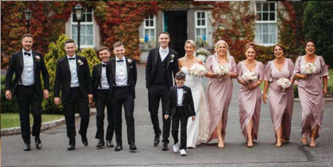
Woodville Walled Garden